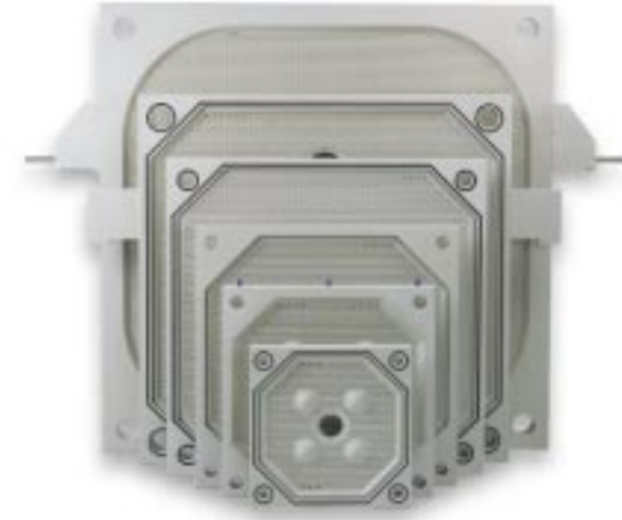
For standard applications and economy, the Klinkau recessed chamber filter plate is the filtration element of choice.

We offer a complete selection of filter plate accessories including spigots, liner pipes, grommets, handles and cake scrapers. Ask your Klinkau Sales Representative about the availability of these and other filtration accessories.