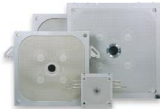
Center feed, replaceable and fixed welded designs.