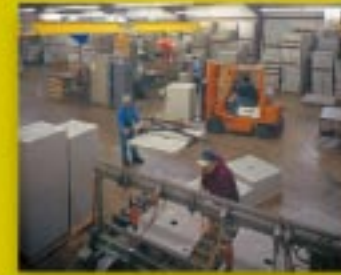
In-house manufacturing of filter plates assures highest quality.

In addition to our U.S.-based sales and manufacturing facility which services North, South and Central America, our parent company, Klinkau GmbH and Co., located in Marktobendorf, Germany, provides filtration solutions to the European community and worldwide markets. Our sister company, Klinkau Asia, services the Pacific Rim.