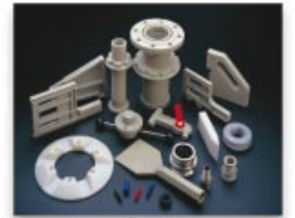
Virtually any filter plate accessory can be provided to complete your filtration needs.

Klinkau recessed chamber filter plates are available in sizes ranging from 250 mm to 2000 mm (also 12" to 59"). Contact your Klinkau Sales Representative for information on your specific application.