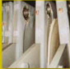
Application: Palm Oil Fractionation Corner feed, fixed welded membrane design.