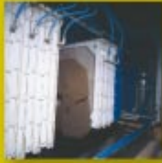
Application: Municipal Water Treatment Replaceable, overhanging, center feed membrane design.