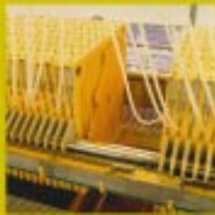
Application: Yellow Pigment Production Center feed, fixed welded membrane design.