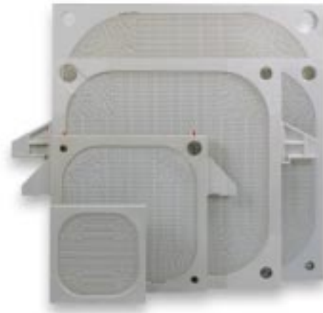
Corner feed, fixed welded design.

We manufacture a complete line of plate and frame filter plates to accommodate the basic, yet unique applications of the filtration industry today. Customers utilize Klinkau filter plates and frames because of their excellent cake washing and air blow-down capabilities, ease of use, and their ability to provide cake thicknesses ranging from 10 mm to 60 mm. Contact your Klinkau Sales Representative for information on your specific application.