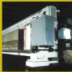
Application: Titanium Dioxide Production Corner feed, fixed welded membrane design.

Klinkau filter plates are utilized in virtually every processing industry worldwide. While our expertise is unsurpassed in the following major applications, we can provide filtration solutions to meet your every specialized need.