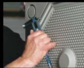
A Klinkau filter plate undergoes several quality inspections prior to shipping.

For almost 20 years, Klinkau has built its reputation on quality workmanship, and a commitment to customer satisfaction. Thousands of customers have relied on our rigorous technical and quality standards to support a multitude of applications worldwide.